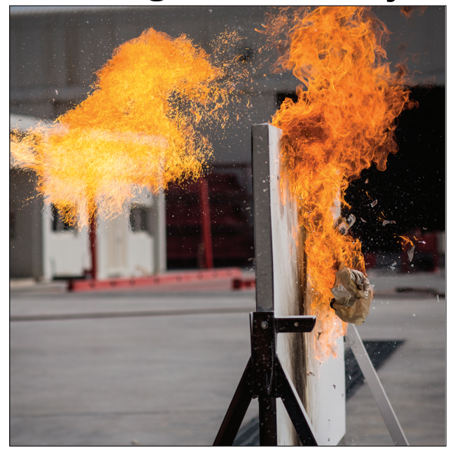
Cost efficient compliance with bourly ratings required by building codes

FIREFREE Coatings, Inc. 580 Irwin Street No. 1, San Rafael, California 94901 415 459 6488 • 1 888 990 3388 • Fax 415 459 6055 www.firefree.com • info@firefree.com